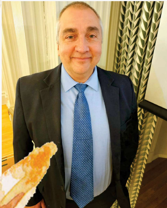
PUNCH'S FANCY PORTRAITS.—No. 37.